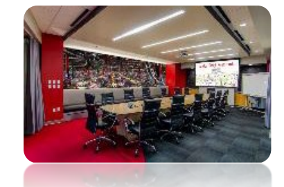
Small Conference / Collaboration Spaces